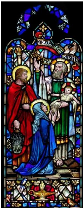
THE PRESENTATION OF THE LORD